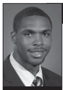
Last Time Out: Fouled out while playing 22 minutes with nine points and two blocked shots.