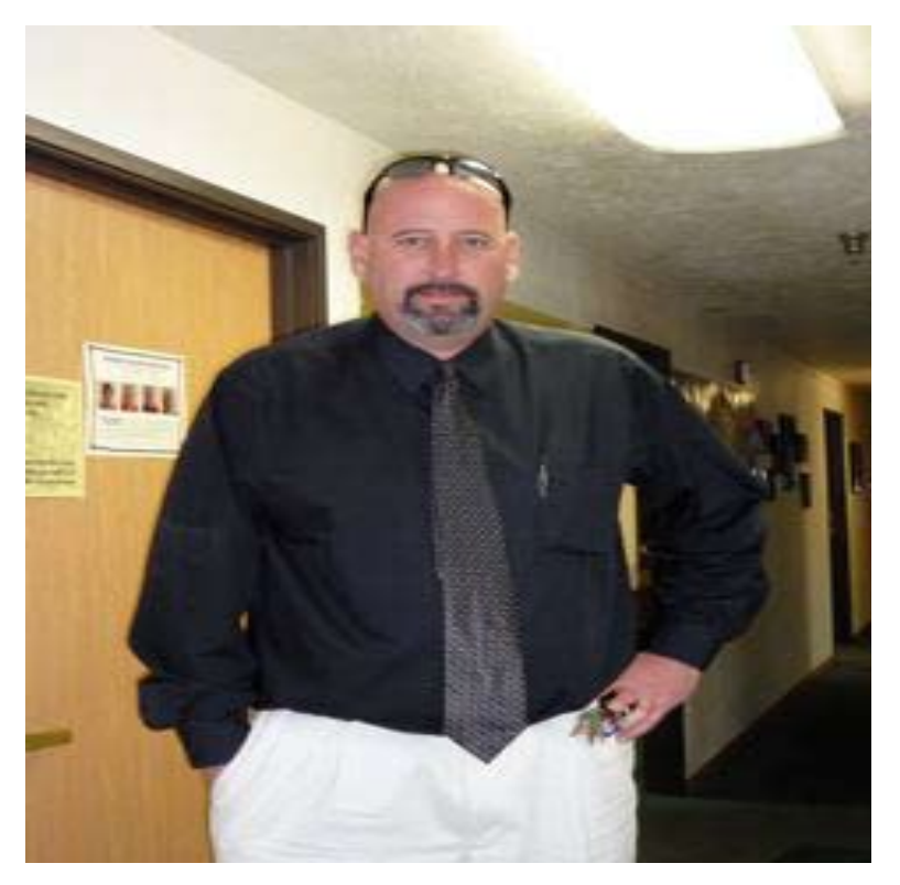
Snod will gladly confiscate items like you see below.