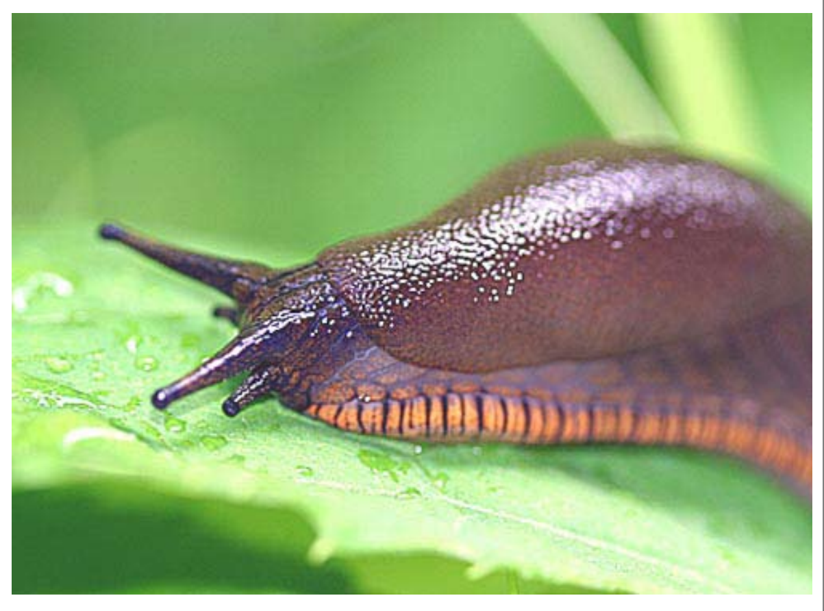
Some might say that this creature is faster than LC's Internet.