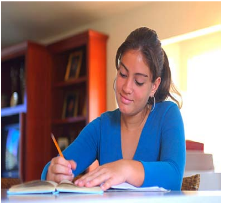
This girl is on the road to success.

Hopefully, in a little while, this problem will be taken care of. But, as of now, I said it before and I'll say it again: my money is on the slugs.