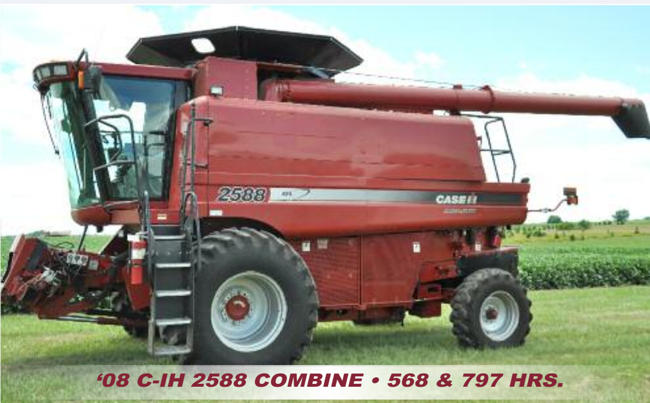
'08 C-IH 2588 COMBINE • 568 & 797 HRS.