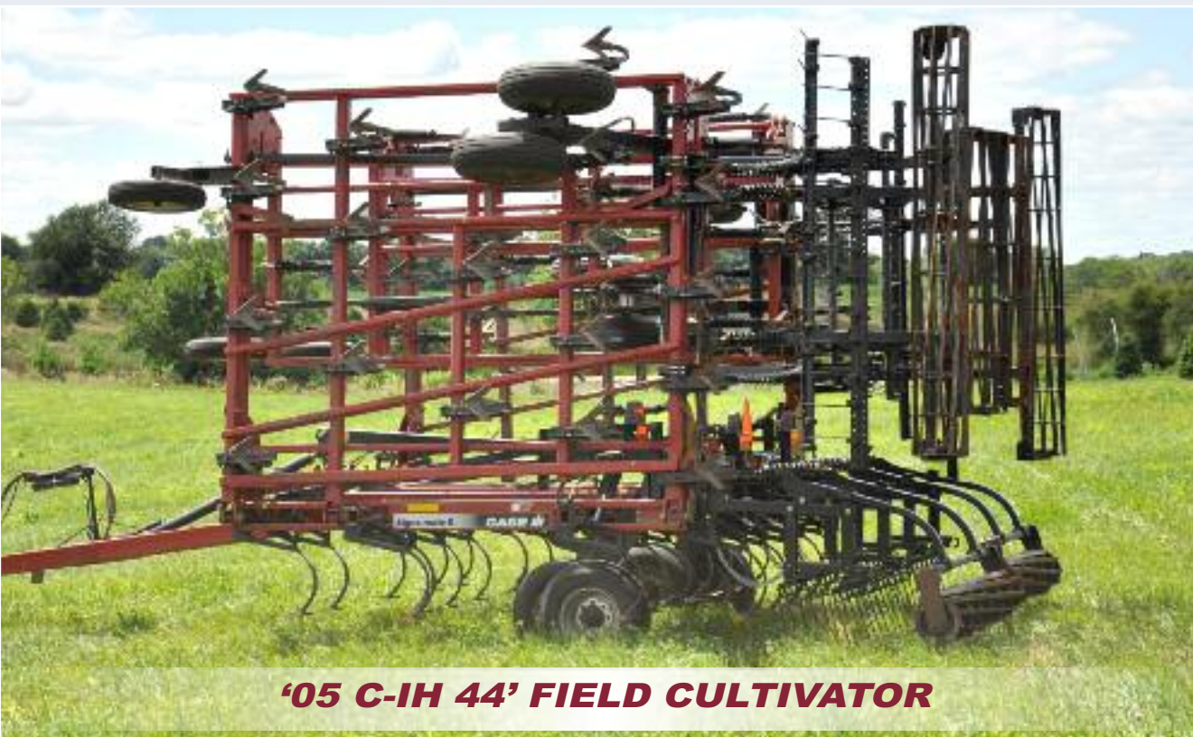
'05 C-IH 44' FIELD CULTIVATOR