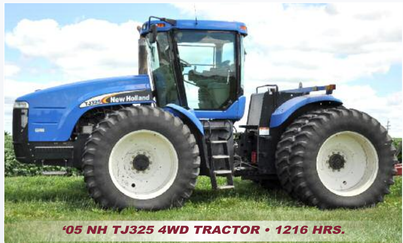
'05 NH TJ325 4WD TRACTOR • 1216 HRS.