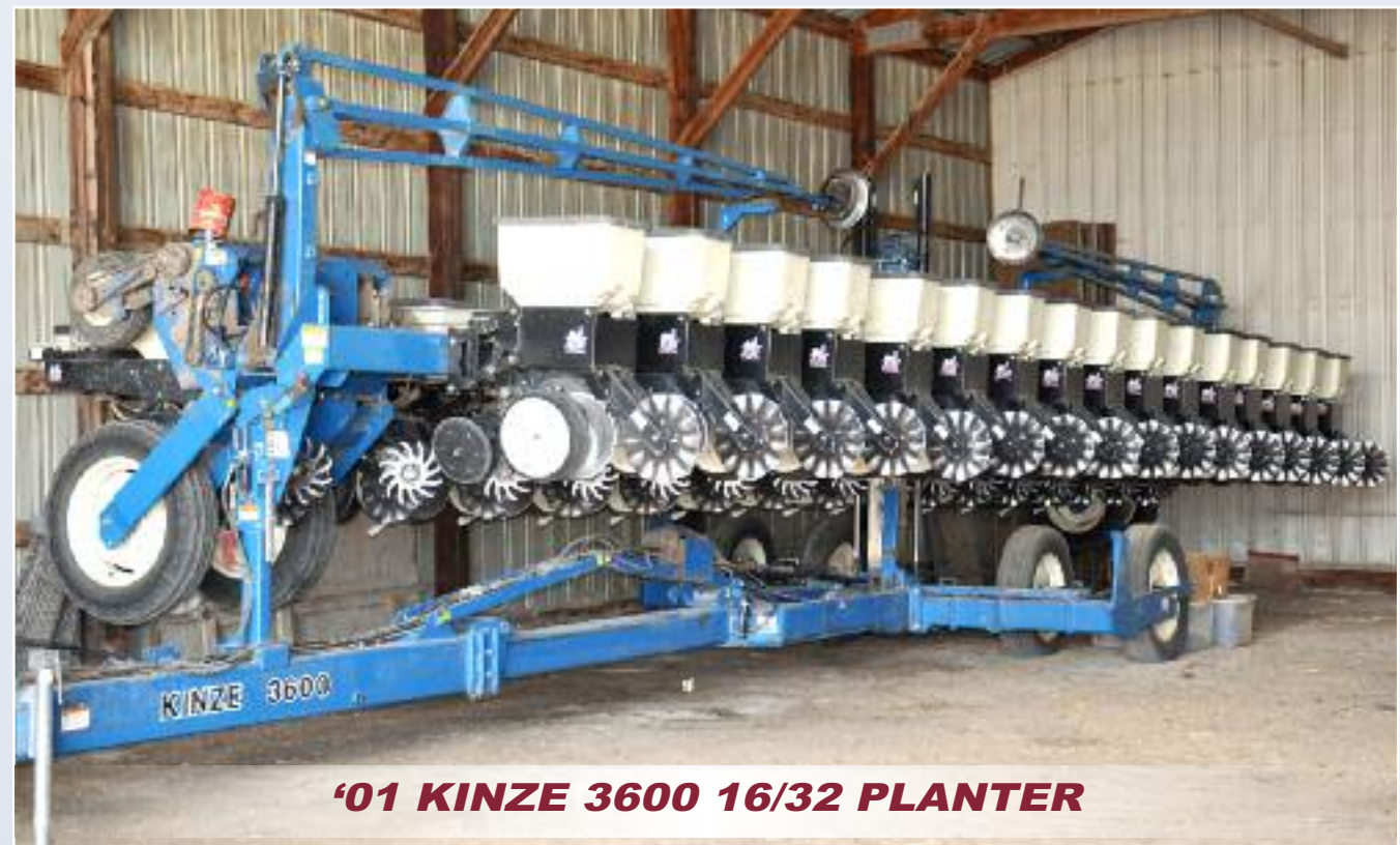
'01 KINZE 3600 16/32 PLANTER