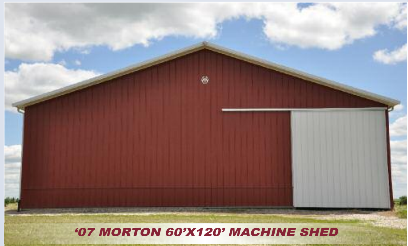
'07 MORTON 60'X120' MACHINE SHED