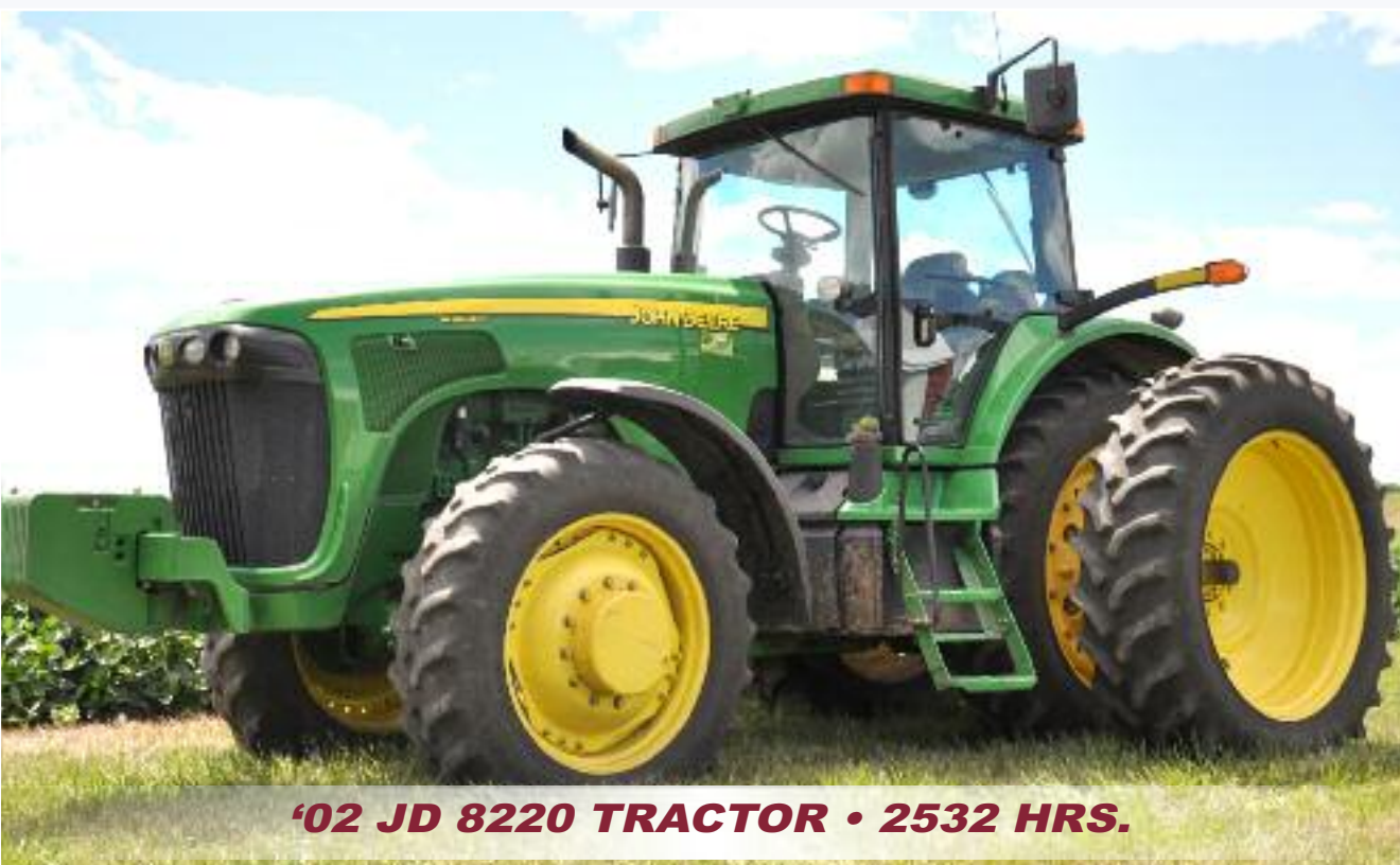
'02 JD 8220 TRACTOR • 2532 HRS.