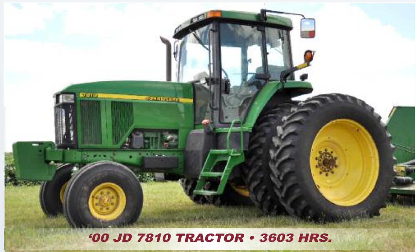
'00 JD 7810 TRACTOR • 3603 HRS.