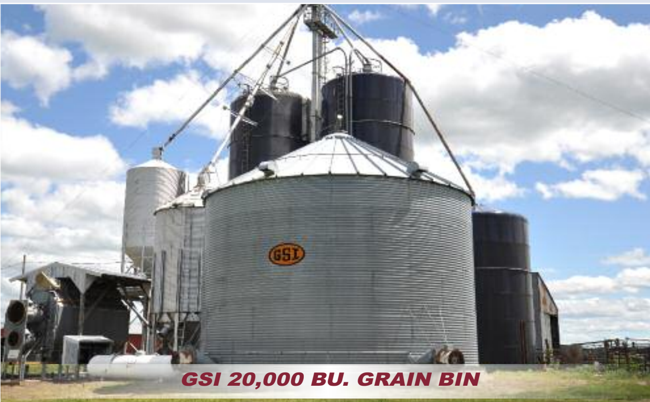
GSI 20,000 BU. GRAIN BIN