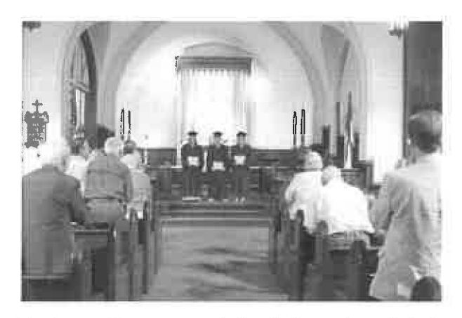
5 - Twenty-three percent of the class participants in our Jobs for Life classes obtained jobs last year. Nearly 10% of those participants who started with income raised their income while participating in the program. Seventy-one percent of those students gained critical skills required for employment, and five of the five college-bound students either obtained college degree or made progress towards that degree.