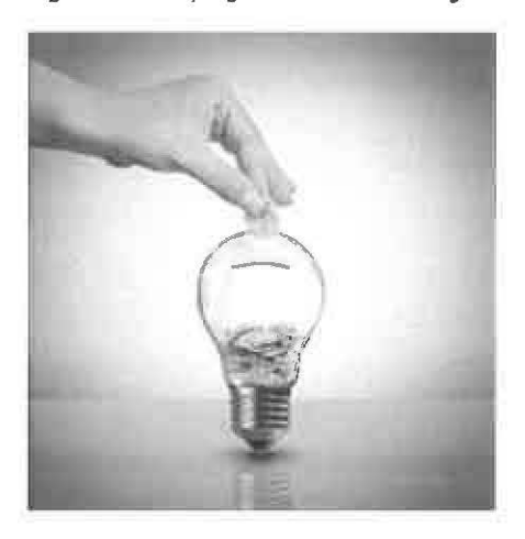
6 - CAPCIL helped nearly 1000 households with their energy bills.