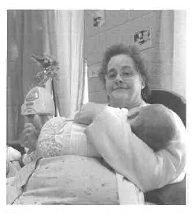
3 - CAPCIL Volunteers donated 167,417 hours to the community last year through our commitment to the Foster Grandparent Program, administrating community service hours, and working with local community members to give of their hearts and time.