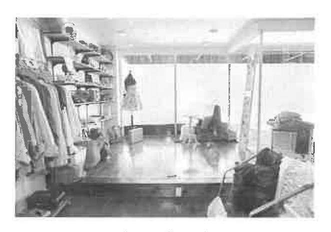
8 - WHAT's NEXT?

CAPCIL will continue to evolve the Economic and Workforce Development role in the community. The Hanger on the Square and the Food Pantry Cooperative will both be critical components of this work!