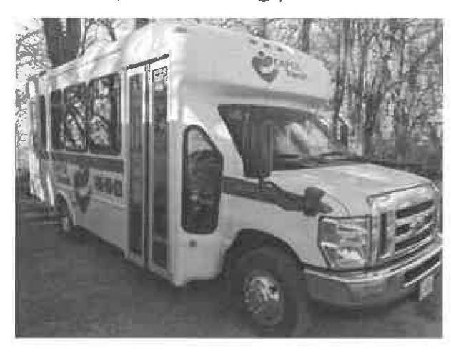
1 - Over 6000 transports for local seniors for medical appointments, shopping trips and other critical transports helping local seniors remain independent.

In 2017, CAPCIL served 2300 families. Three-hundred and nineteen single family homes, 275 two-parent households, 1,264 single person homes (mostly seniors), 183 two-person homes (no children) were served. Sixteen hundred and twenty-seven of those homes reported one or more sources of income, the working poor.