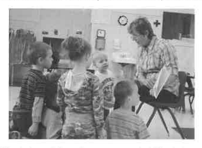
{\it 4-CAPCIL\ provided\ over\ 100\ families\ in\ Lincoln/Logan\ County\ access\ to\ Early\ Childhood\ Education\ both\ in\ the\ classroom\ and\ through\ home\ visitor\ programming.}