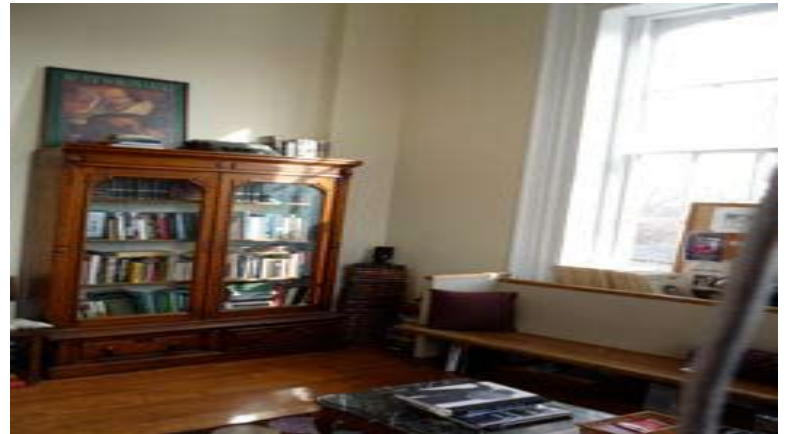
Franz's plush office, courtesy of a UH fire.