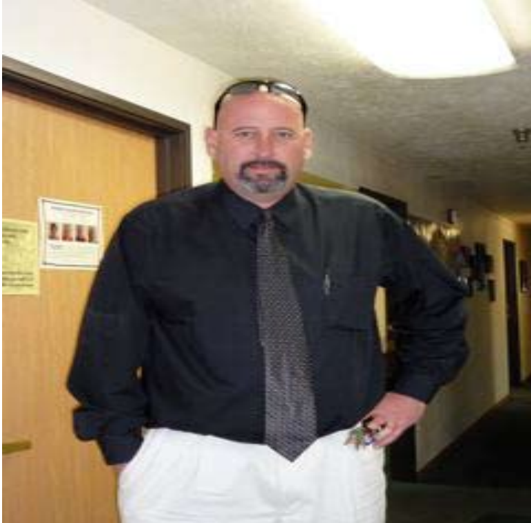
Snod will gladly confiscate items like you see below.