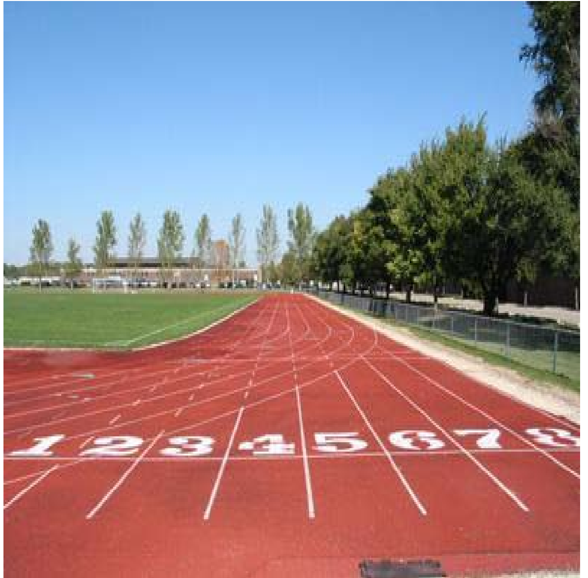
Check out LC’s awesome track! Oh wait, we don’t have one.