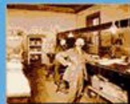
Lincoln's Oldest Bank Founded 1904