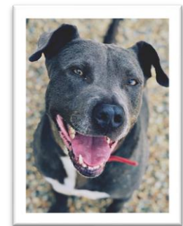
Titan, available for adoption.