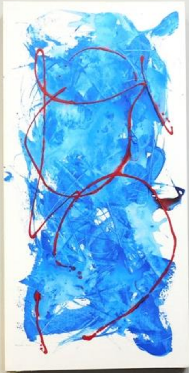
W. Chapman The Sun Acrylic on canvas 24 x 12" $80