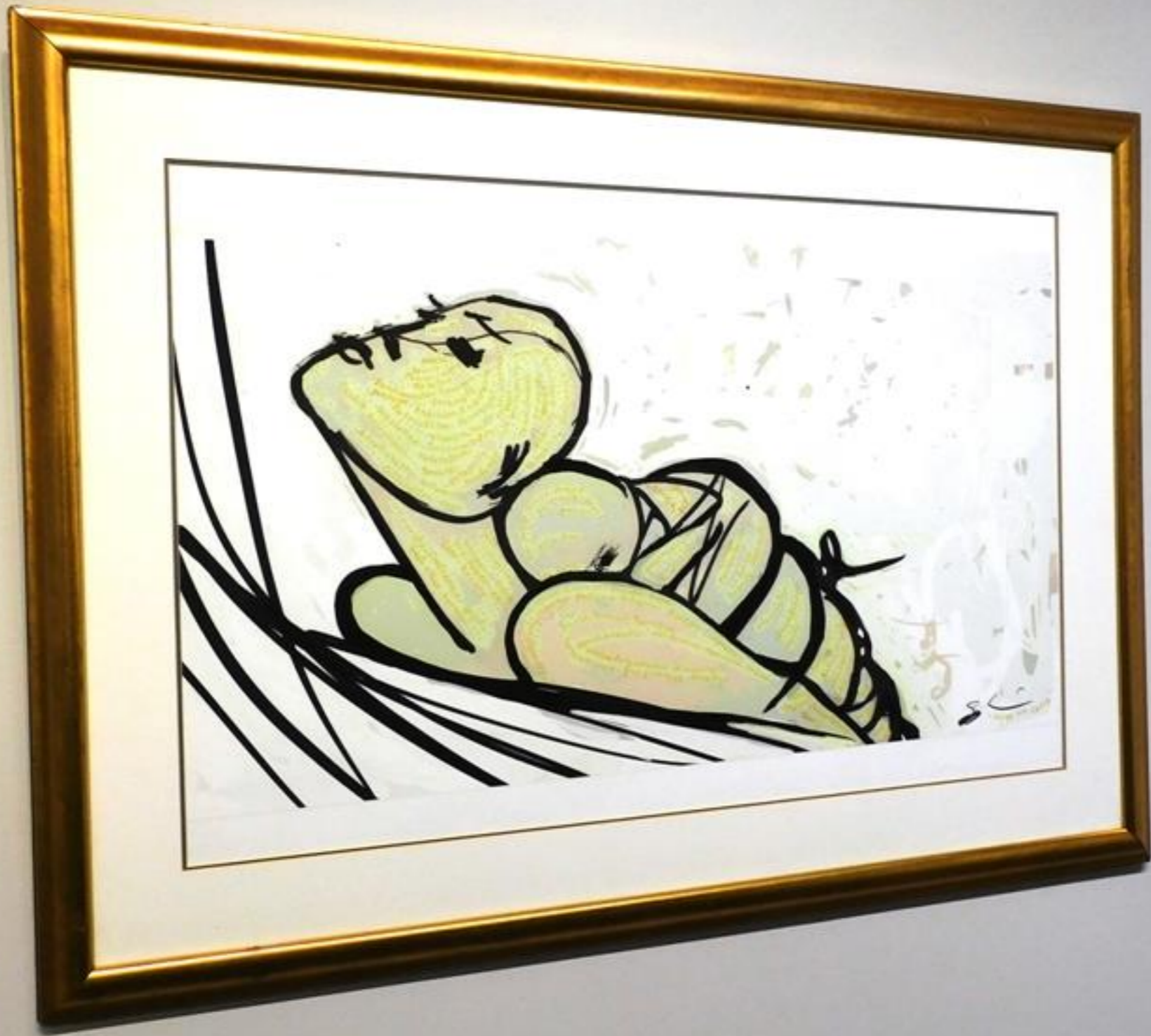
Francis Bacon Nude Reclining 1964 Oil on canvas 100 x 130 cm