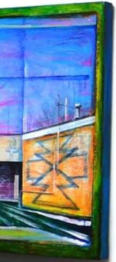
Small text label below the green-bordered painting.