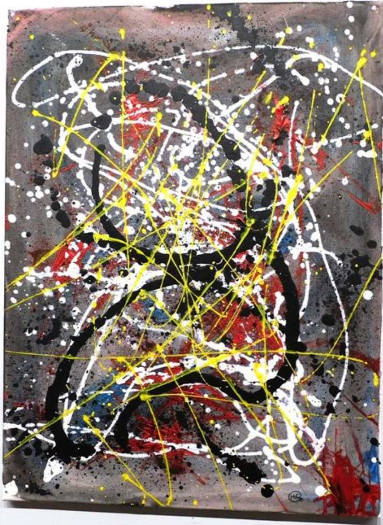
H. Chapman Abstract Acrylic on canvas 18 x 24" $80