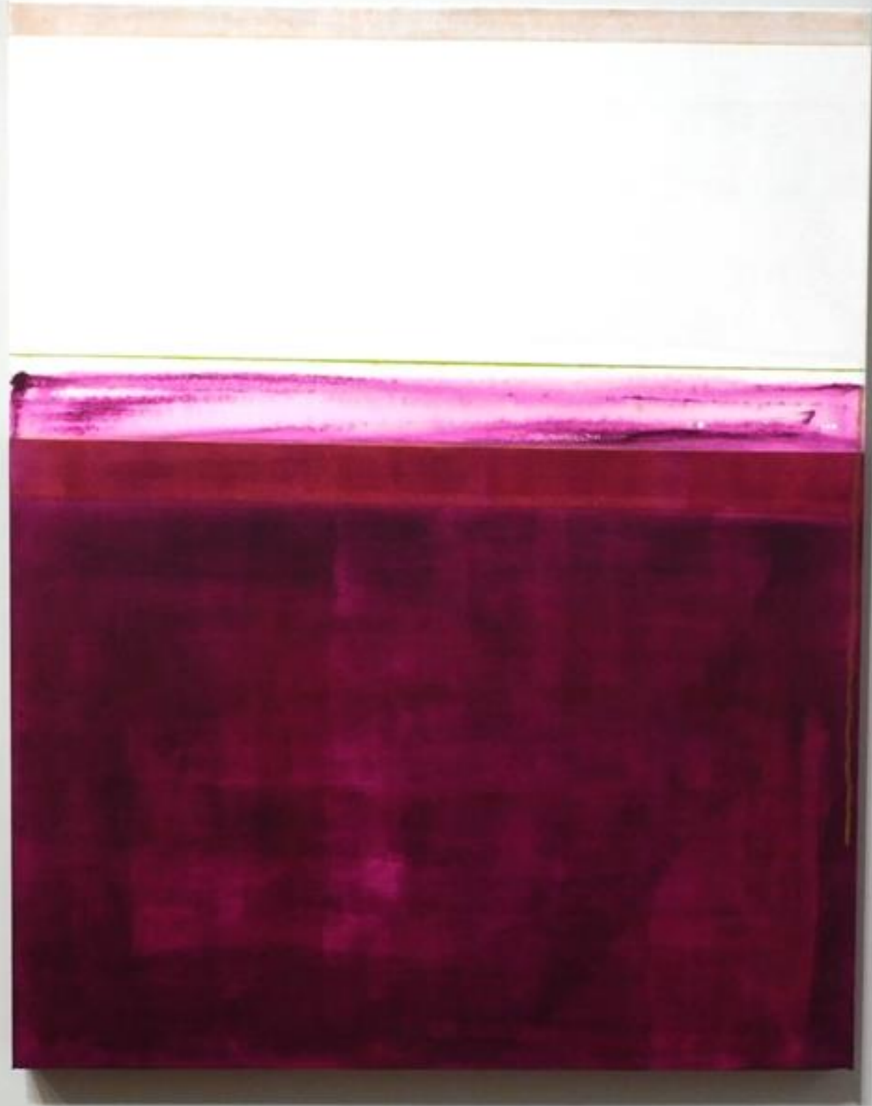
White Wood 1997 Mixed media on canvas 24 x 36" 6000