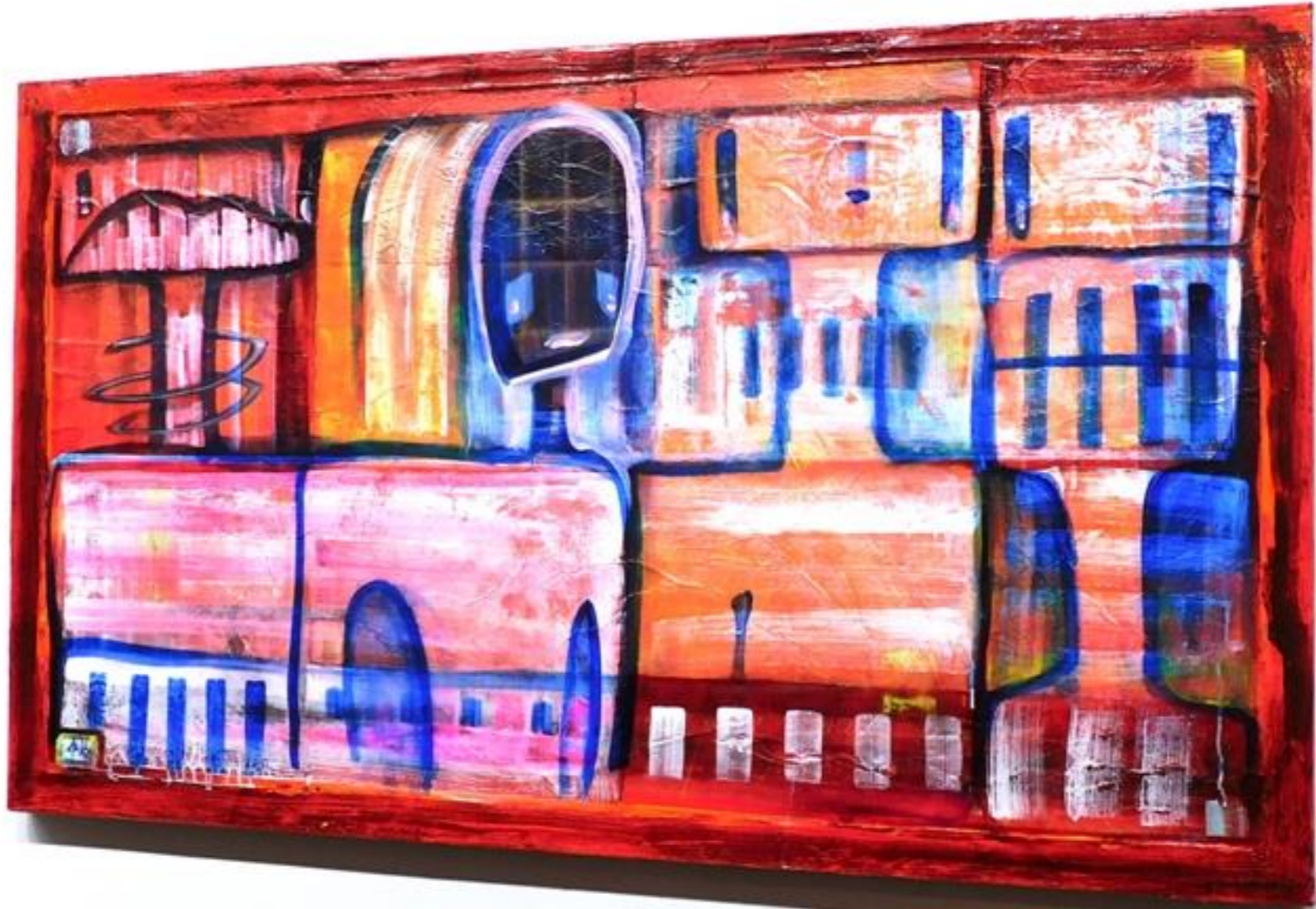
Small text label below the red-bordered painting.