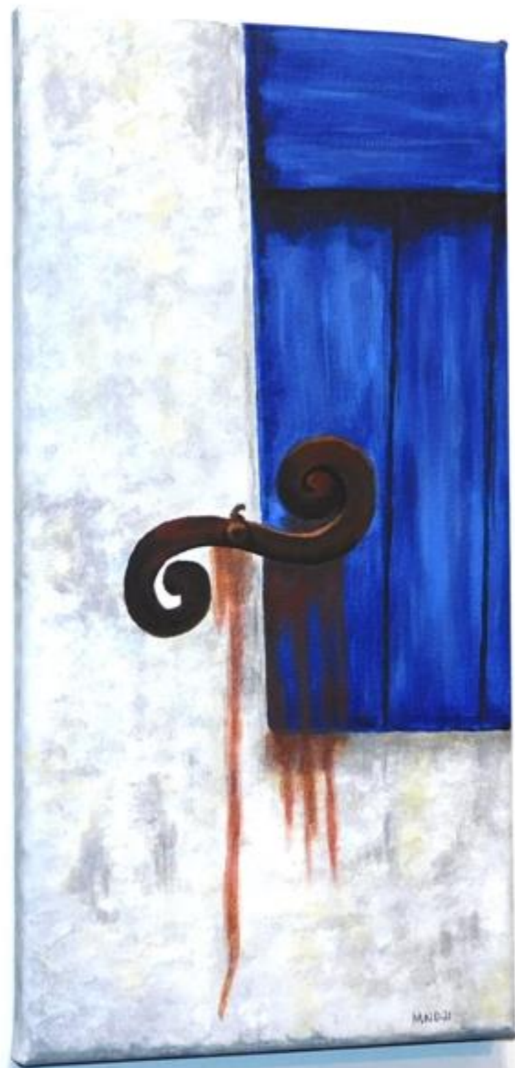
Margie Douglas Rusty Shutter Dog Acrylic on canvas 8 x 16" $35