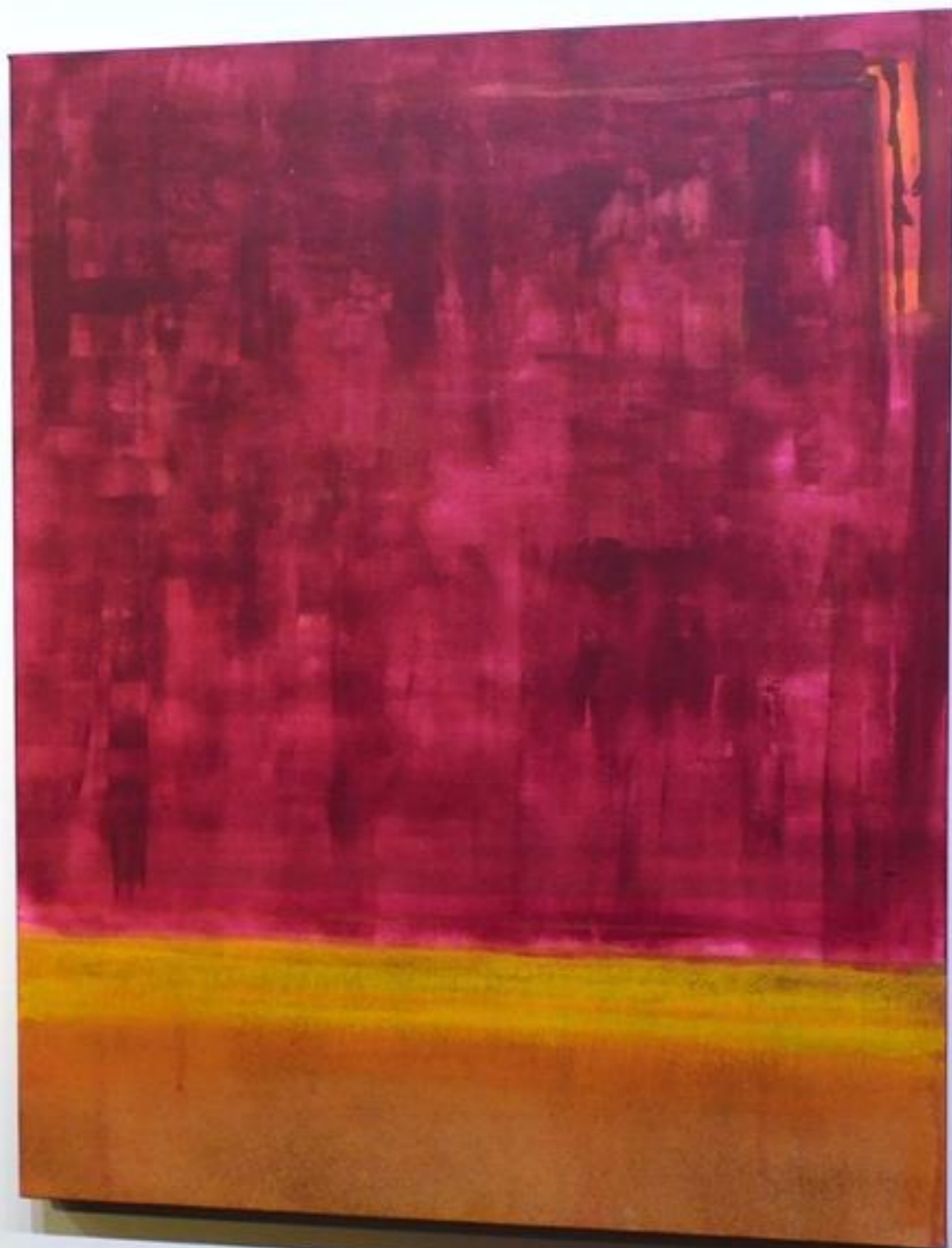
Mary Black Abstract Painting 1960s 1960