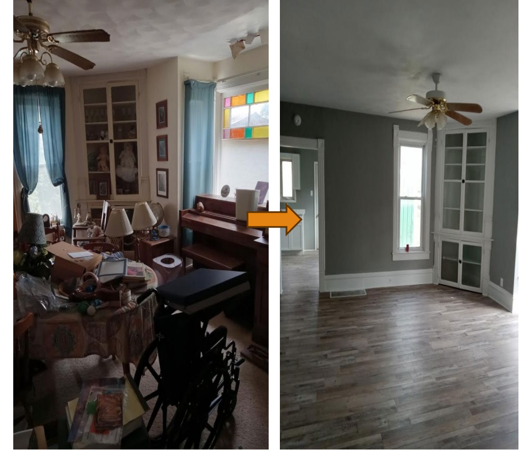
Kitchen Living room